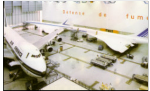
Concord Hangar, Paris