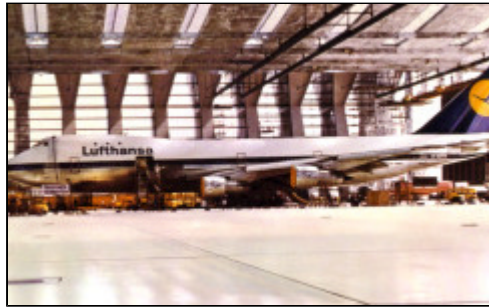
Jumbo Hangar, Frankfurt