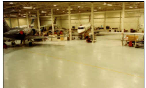
Gulfstream Hangar, Savannah