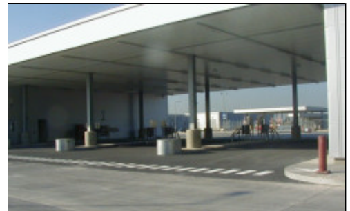
De-Icing Facility, Heathrow